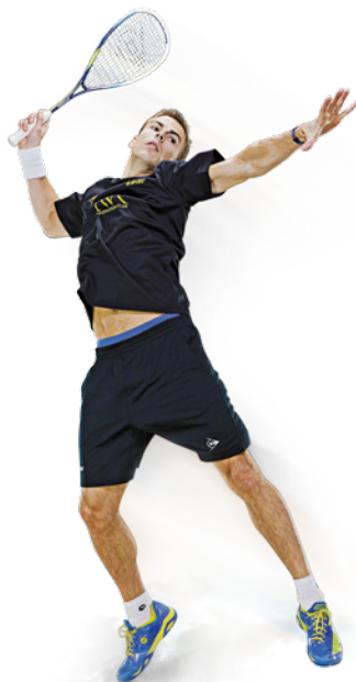
Na zdjęciu: Nick Matthew, III krotki Mistrz Świata